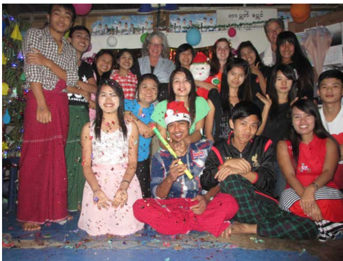
Second Year students had a very nice Christmas party with Teacher's family