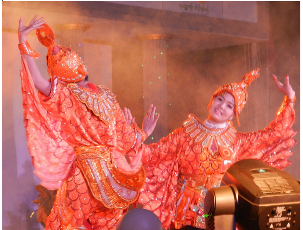
A male and female Sheldrake dance in Mon traditional dance

About 1000 years ago, Gautama Buddha came to travel to Sowwana Bhummoi city. At that time, he had eight years of being called Buddha and he and 500 other monks saw two Sheldrakes, a male and female, standing on a small piece of land in the middle of the ocean. They had to stand in the center of the