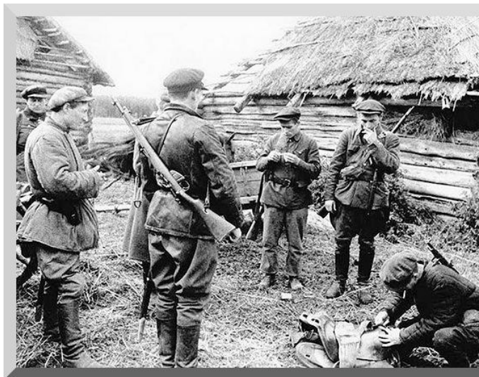
Many people have been affected by the many wars in history

War, one of the awful global issues, sounds terrible and powerful. And it is harmful for the entire world people live in. For many years citizens and civilians have felt unhappily watching and reading the news of worsening war at the continental lands and seas, where the world's militaries have attacked and shot each other. That happened, depraving the lives of each one, because announcers just mentioned about something bad from war ends. However, I believe war has both good sides and bad sides.