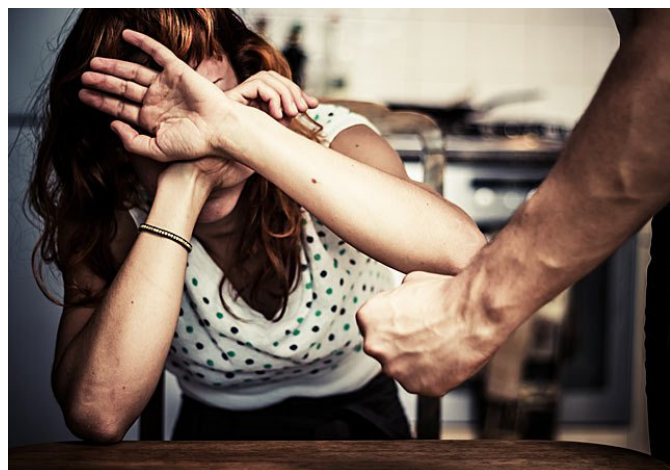
Physical Abuse Steals Our Human Rights