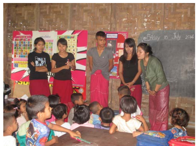
While Teaching at Children of the Forest

As for us, we get a lot of knowledge and experience because we make lesson plans and we also think if the lessons are easy to understand for students. We are happy to get a chance to teach students because we know different ways how to teach them to be interested in the lesson. For example we show actions, give examples, use hand gestures, use body language and show pictures to them. So, they can easily understand the