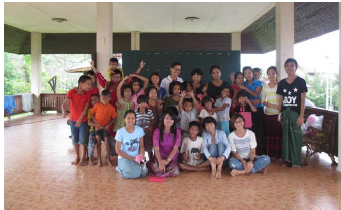
Second Year students help with BHI's children training

Her activities are how to make children improve and how to protect themselves during their life. Every child has to choose by themselves the things that are dangerous for people or useful for people (ex: book, knife, plastic, rice). And then also how to take care about themselves to have good health. For example before they eat something and after they do something, they have to wash their hands seven steps with soap, so it is good way to reject