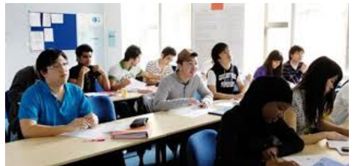
Learning English in a language class

Therefore, people should learn English even if it is hard to learn. Everyone knows that whatever people start to learn is really difficult, surely because no one is perfect before they know anything. For example,